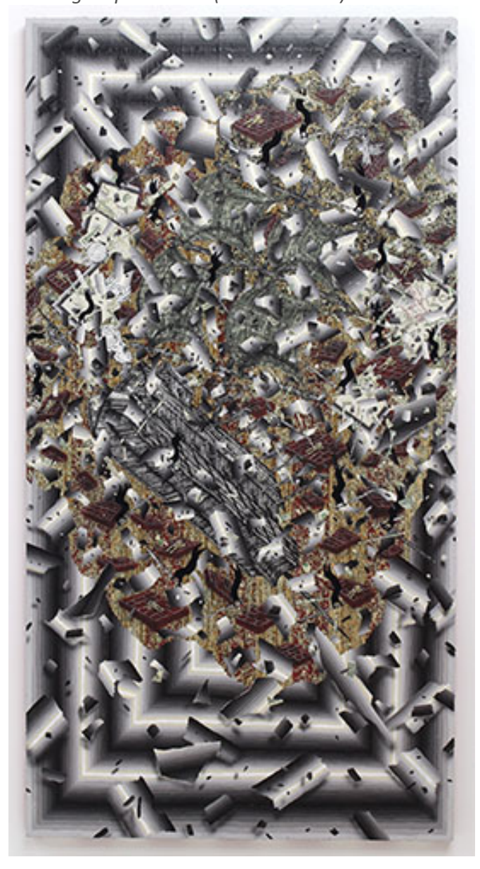
Floating Ship in Chaos (Blown to Bits)

The show opens with a series of paintings on wood panels. They appear as jigsaw puzzles, their sliced-open edges revealing Day-Glo colors. They're suitably toxic-looking but only a preface to the main event: Blown to Bits (Exploding Wall) , a 20-foot long