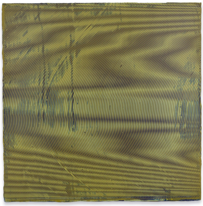
Anoka Faruqee. 2013P-32, 2013; acrylic on linen on panel; 22.5 x 22.5 in.