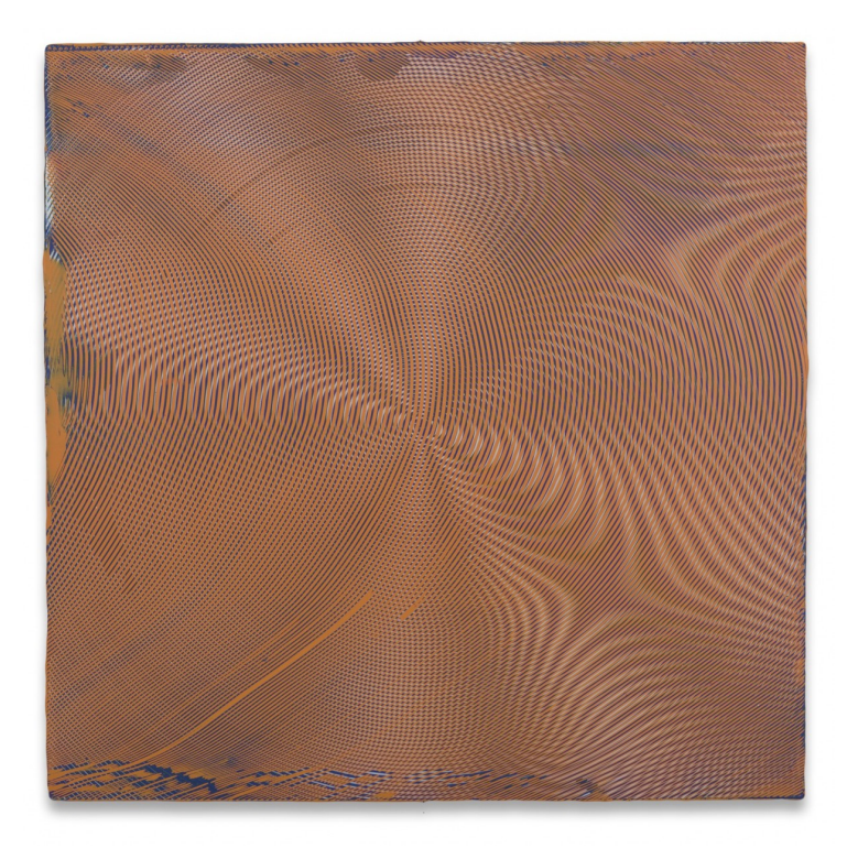
Anoka Faruqee. 2013P-29, 2013; acrylic on linen on panel; 33.75 x 33.75 in. Courtesy of the Artist and Hosfelt Gallery

Survey 2013P-34 from afar and it resolves as moiré. Dissect it up close and it dissolves into painted lines and arcs. Experience it from the middle distance and pattern and paint coexist: green over yellow over purple—fading at times to blue—over white. The combination of green and yellow arcs on the right side of the painting, which form the top layer of